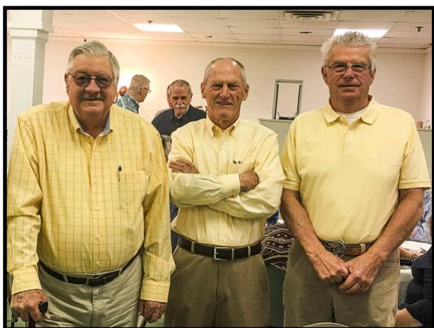
OVPC contingent at the Milford housing Development Corporation breakfast.