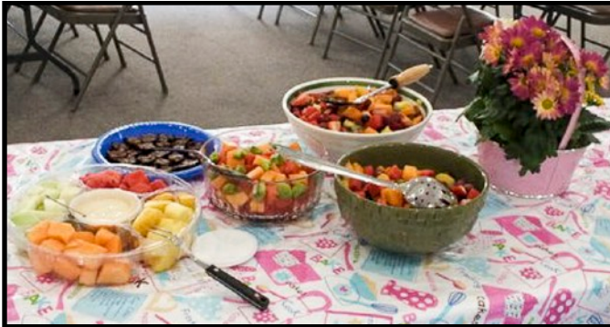
The ladies of the church say thank you to the men for our lovely Mother's Day Brunch.