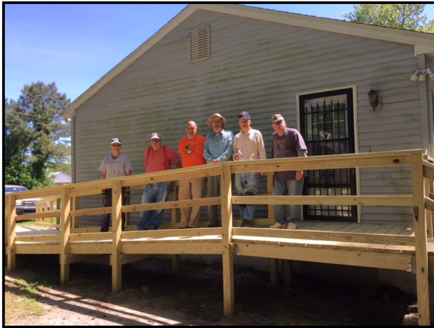
Another ramp finished.