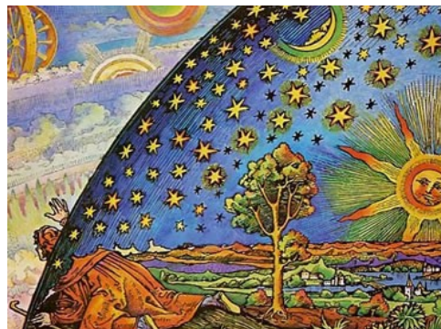
Summer Solstice June 21st