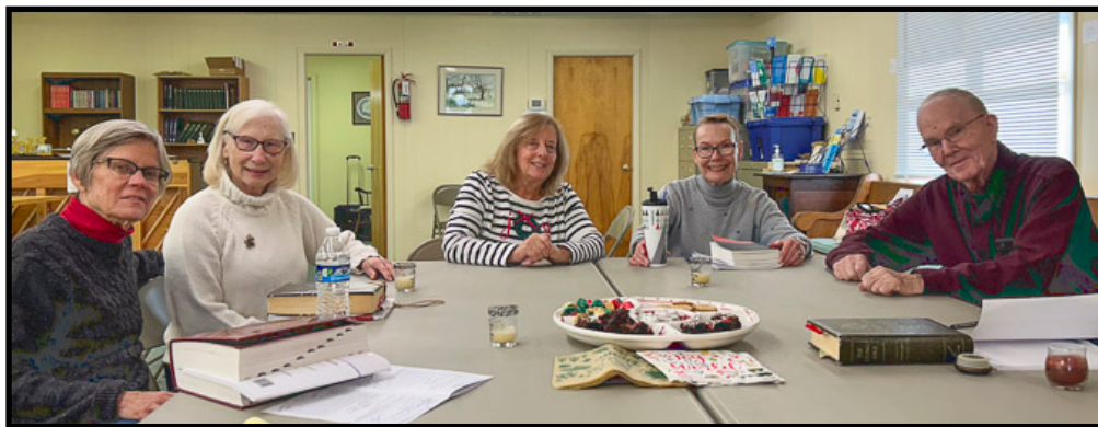
December's Bible study group.

YARN meets on Monday, January 8th in Fellowship Center between 10-1 pm. Bring your lunch and any questions you may have about how and why we make prayer shawls. We will teach you how to knit or crochet if you have questions and we have lots of yarn and needles to share. We are a fun group of ladies and invite you to join us!