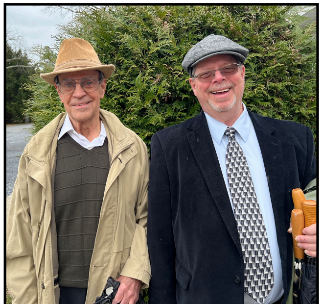
Guys in hats.