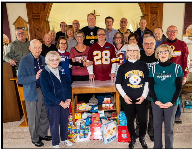
Our Jerseys from last year.