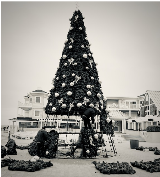
Taking down the tree.