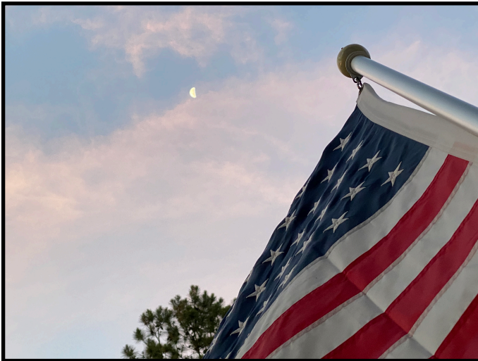
Early morning moon. Lorie Hartsig