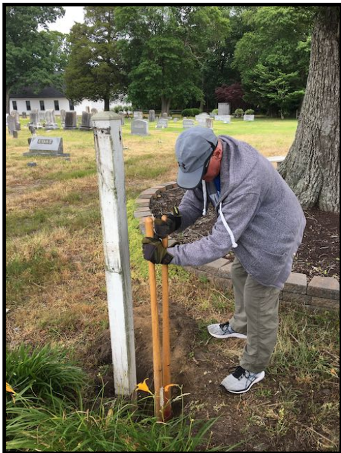
Old cemetery sign posts being removed.