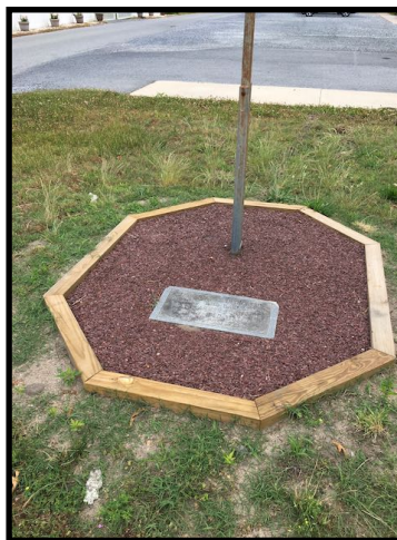
New borders around our historical marker and flag pole.