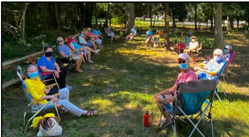
First meeting of the Socially Distanced Group - June 29th

We closed the meeting with the Mitzpah. at 2:20 PM.