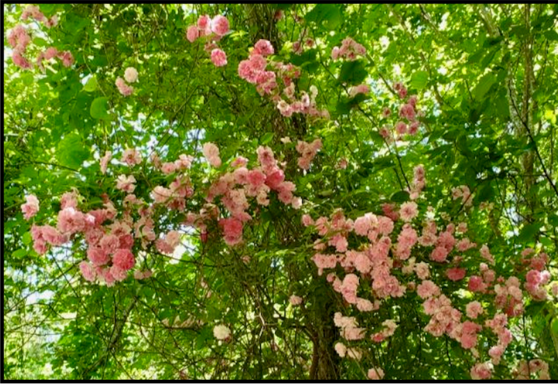
Wild carnations along the Prickly Pear Trail.