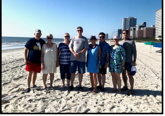
Team Turner's crew walked in Myrtle Beach, SC