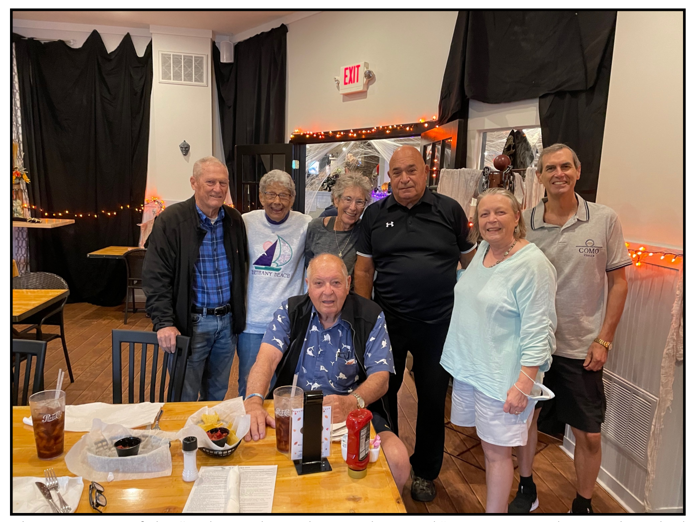
These are some of the "Ladies and Gentlemen who Lunch" on Taco Tuesdays at The Salted Rim.

The restaurant is at 35553 Atlantic Ave , Millville, DE 19967 . We invite OVPC to join us at 12:30 every Tuesday!