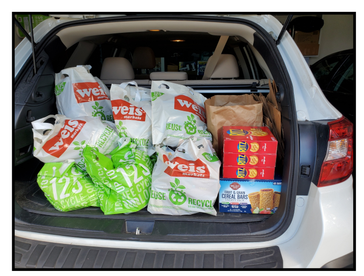
Packed up to deliver Blessing Bags