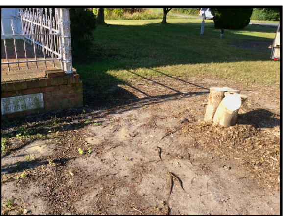
Frankford Church before and after trimming.