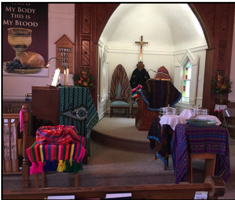
Beautiful cloths from around the world displayed October 6th.