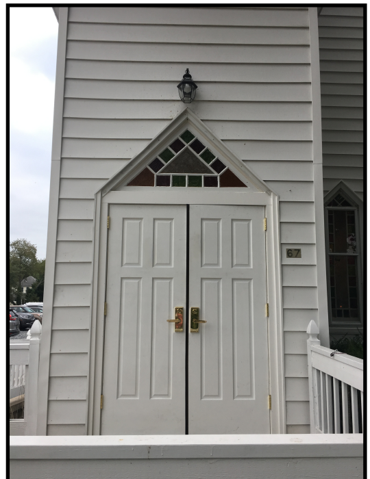
New exterior Sanctuary doors.