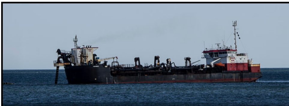
Bethany Beach beach replenishment under way.