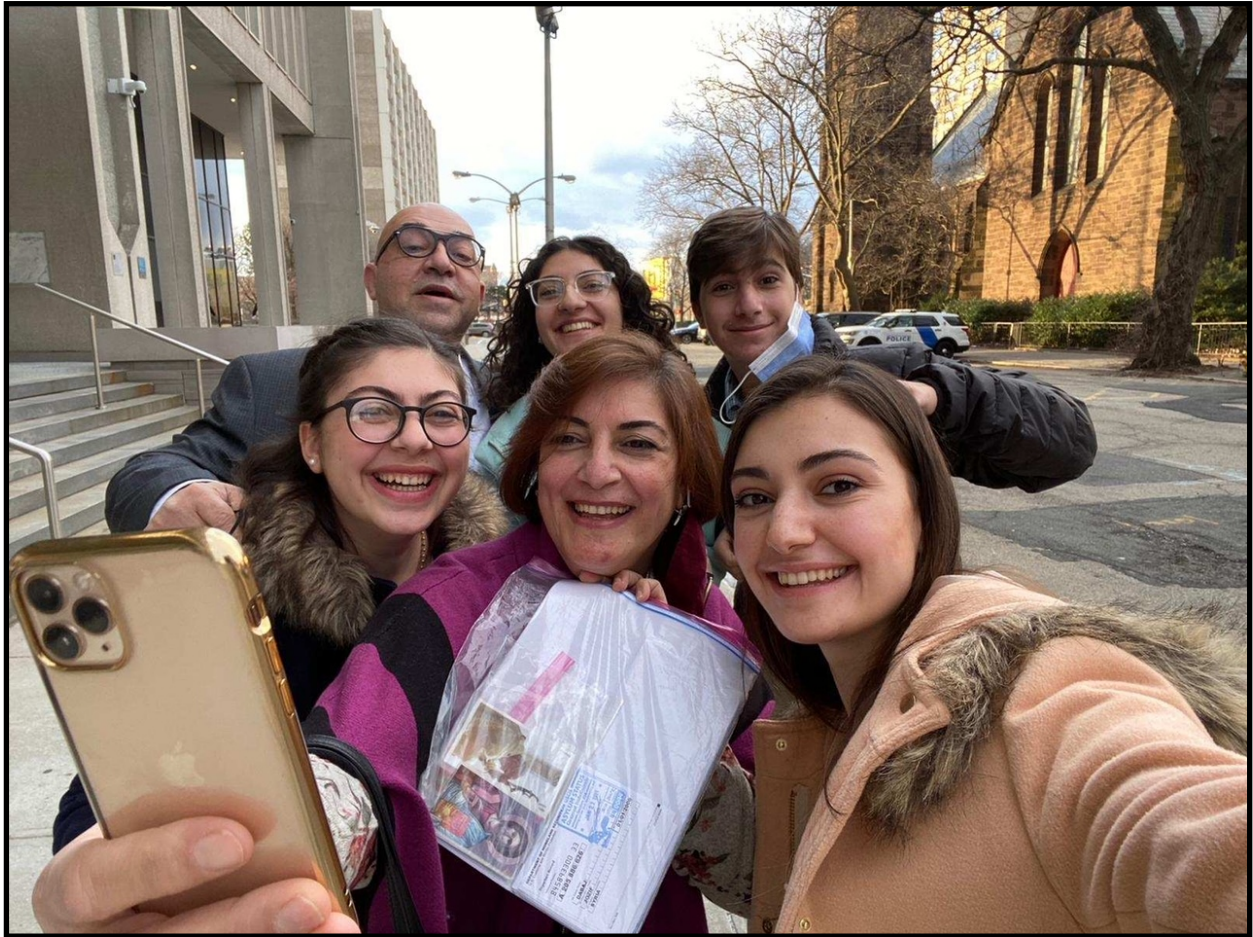
Next step: Citizenship! The Dabaj family receives their Green Cards so now they can apply for citizenship.