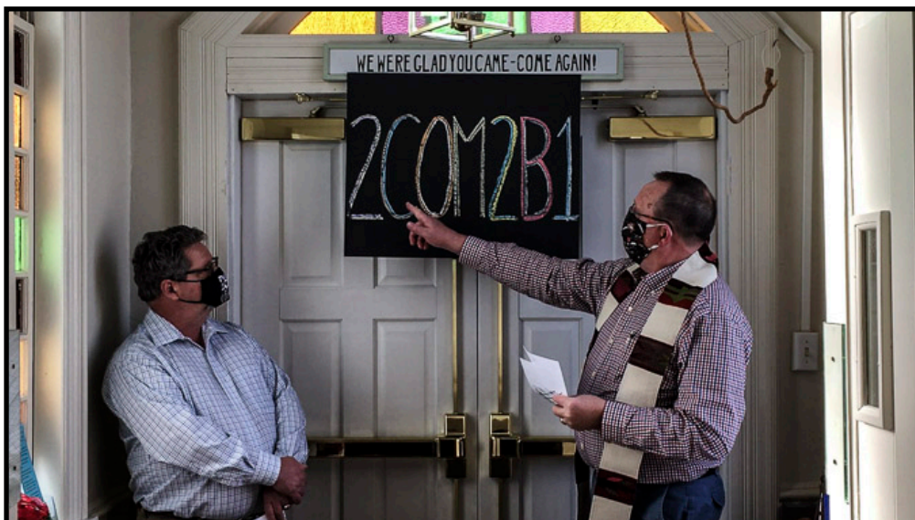
Chalking of the Door: An Epiphany Tradition.