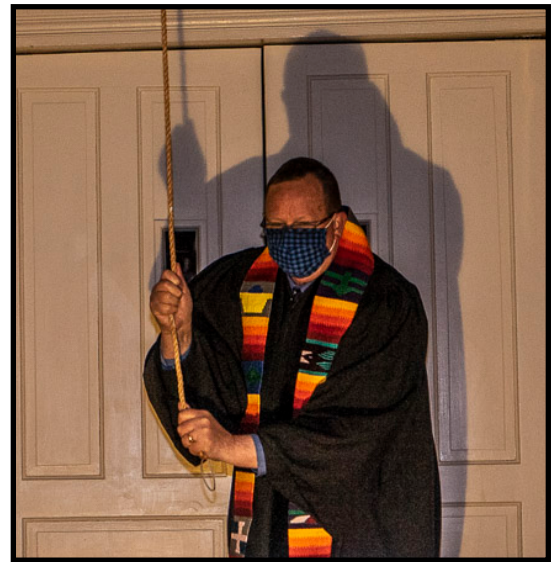
Lighting the light and ringing the bell.

By affirmation of the Session, OVPC participated in the National Remembrance of the 400,00 Americans who have lost their lives to COVID-19.