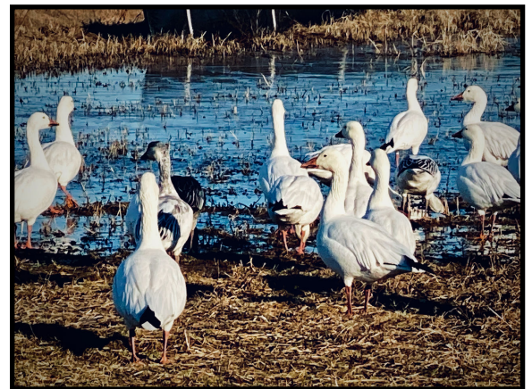
Return of the snow geese.