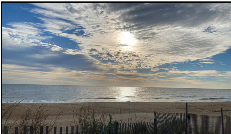
Bethany Beach sunrise.