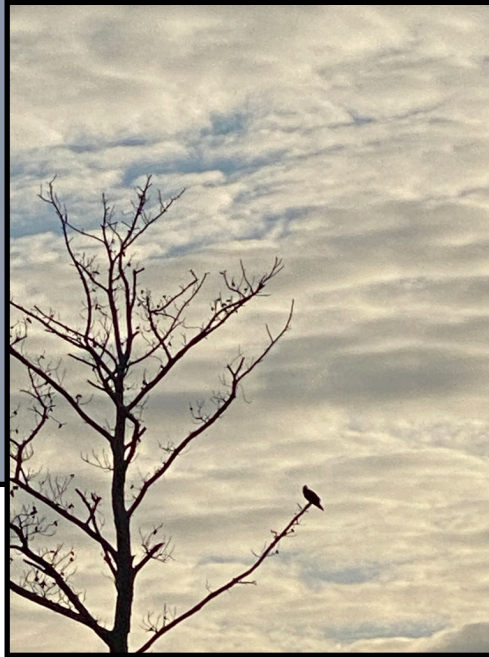
Osprey in tree.