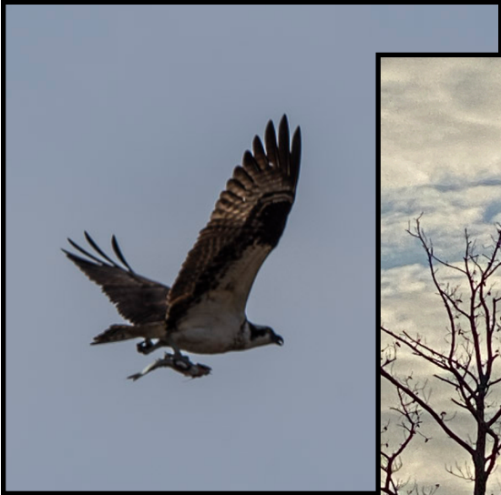
Bringing home dinner.