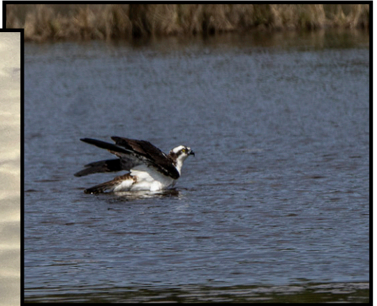
"Splish splash I was taking a bath...."